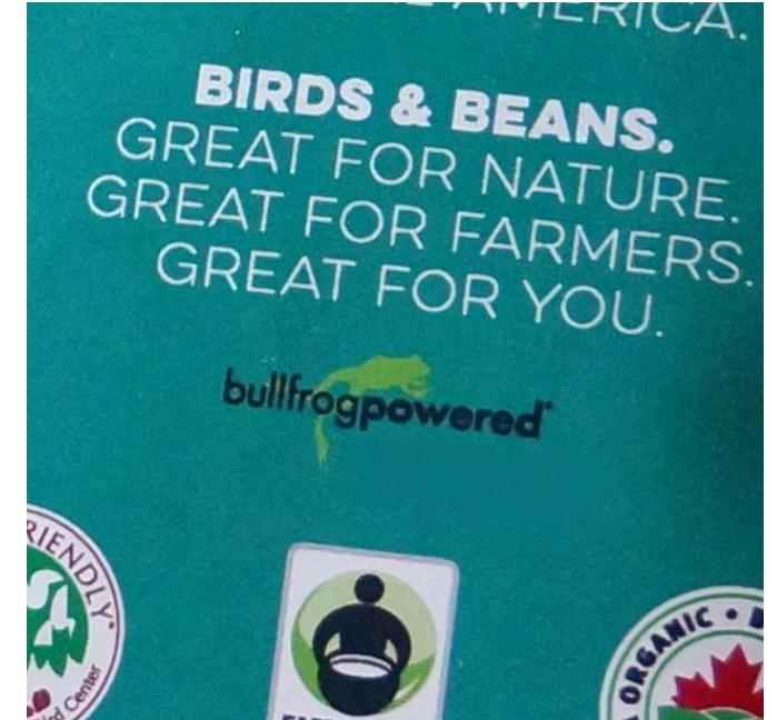
Paper & cardboard boxes

To use Bullfrog Power's logo on external packaging, please send a mockup to biz.marketing@bullfrogpower.com for approval.