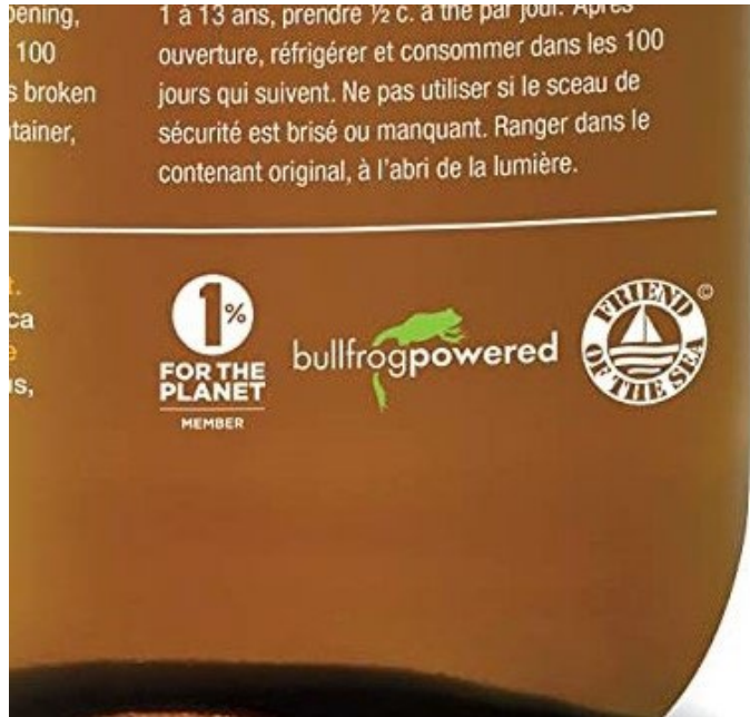
Glass & metal containers

We can find suitable logo placements and statements based on your unique needs. Here are some examples: