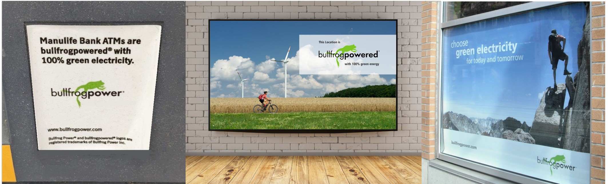
Decal on location